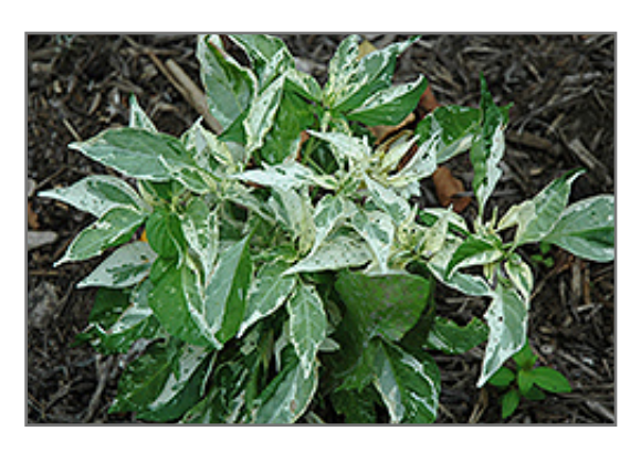
Fish Ornamental Pepper