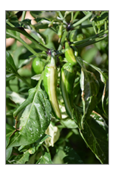
Fish Ornamental Pepper fruit

Fish Ornamental Pepper is an herbaceous annual with an upright spreading habit of growth. Its medium texture blends into the garden, but can always be balanced by a couple of finer or coarser plants for an effective composition.