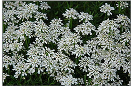
Little Gem Candytuft flowers