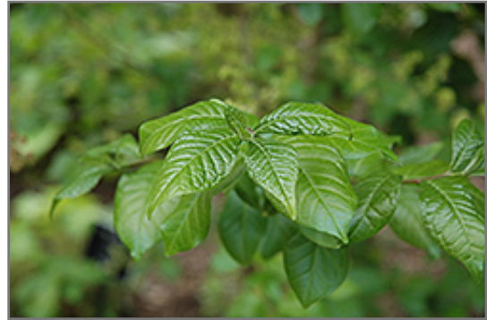
Aurea Orixia foliage