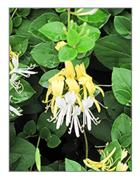
Hall's Japanese Honeysuckle flowers