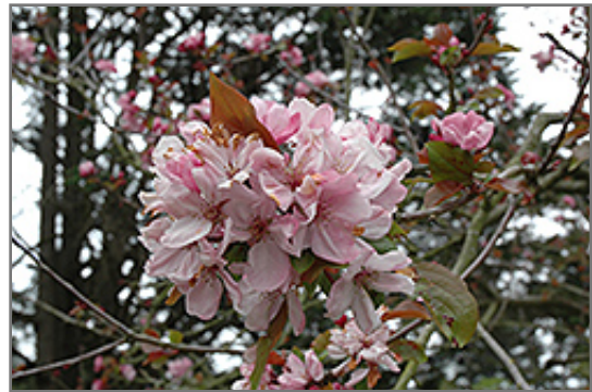
Liset Flowering Crab flowers