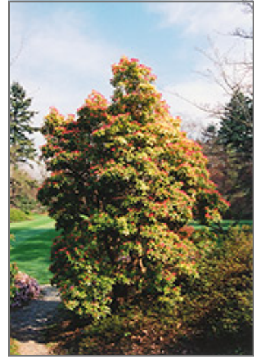
Valley Fire Japanese Pieris

* This is a 'special order' plant - contact store for details