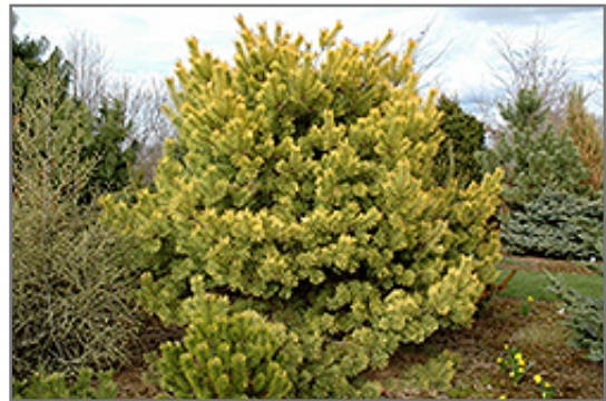
Golden Scotch Pine