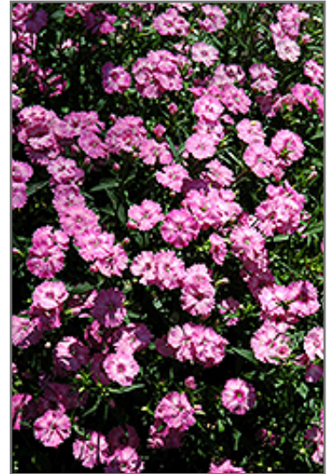
Blue Hills Pinks flowers

Blue Hills Pinks is recommended for the following landscape applications;