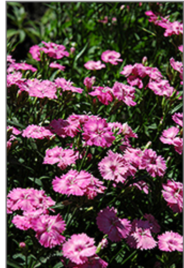
Blue Hills Pinks flowers