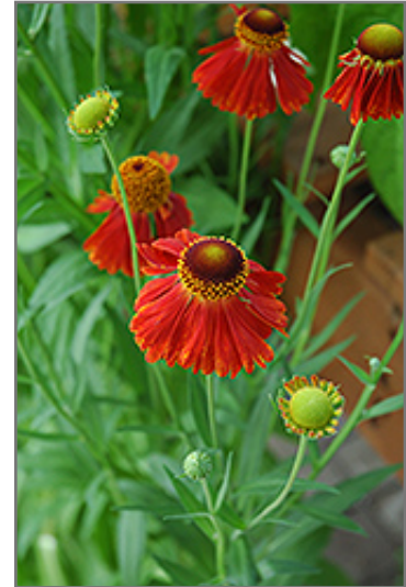
Moerheim Beauty Sneezeweed flowers