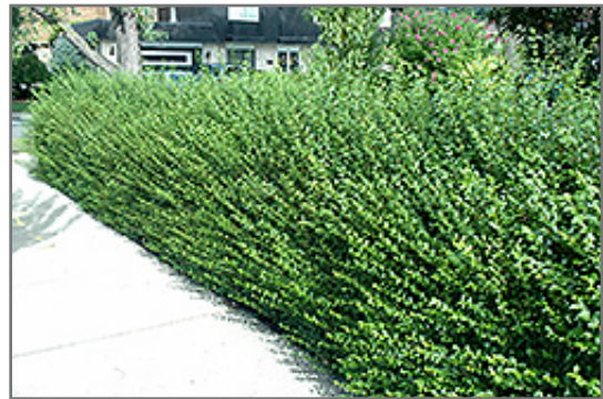
Amur Privet