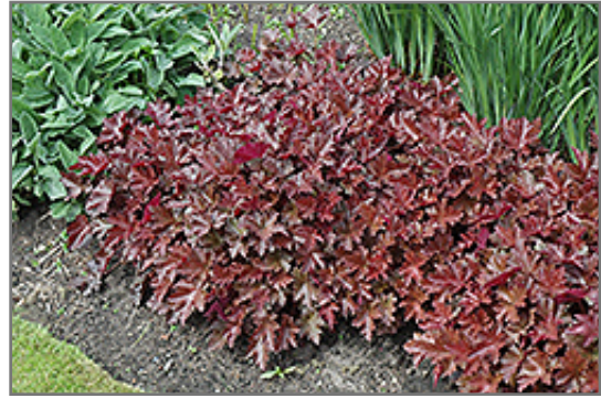
Chocolate Ruffles Coral Bells

This is a relatively low maintenance plant, and should be cut back in late fall in preparation for winter. It is a good choice for attracting hummingbirds to your yard. It has no significant negative characteristics.