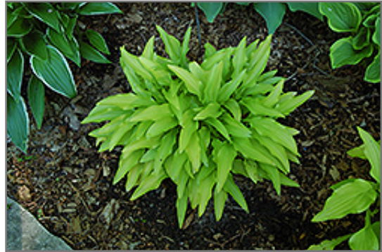
Bitsy Gold Hosta

Bitsy Gold Hosta is recommended for the following landscape applications;