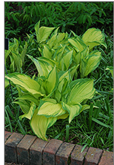
On Stage Hosta