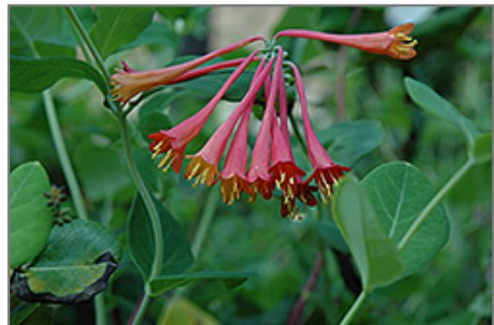
Alabama Scarlet Trumpet Honeysuckle flowers