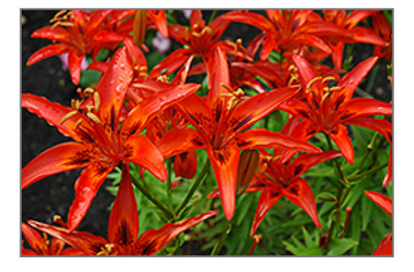
Salsa Lily flowers

Salsa Lily features bold tomato-orange trumpet-shaped flowers with orange overtones and dark red stripes at the ends of the stems in early summer. The flowers are excellent for cutting. Its narrow leaves remain green in color throughout the season.