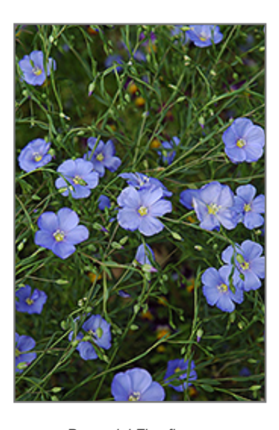
Perennial Flax flowers

Perennial Flax will grow to be about 24 inches tall at maturity, with a spread of 12 inches. When grown in masses or used as a bedding plant, individual plants should be spaced approximately 8 inches apart. It tends to be leggy, with a typical clearance of 1 foot from the ground, and should be underplanted with lower-growing perennials. It grows at a fast rate, and under ideal conditions can be expected to live for approximately 3 years. As an herbaceous perennial, this plant will usually die back to the crown each winter, and will regrow from the base each spring. Be careful not to disturb the crown in late winter when it may not be readily seen!