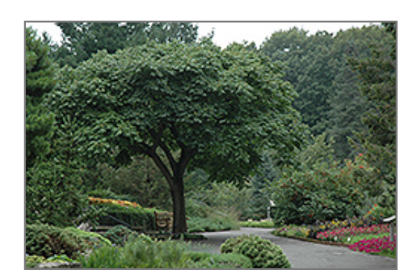
Amur Cork Tree

Amur Cork Tree is recommended for the following landscape applications;