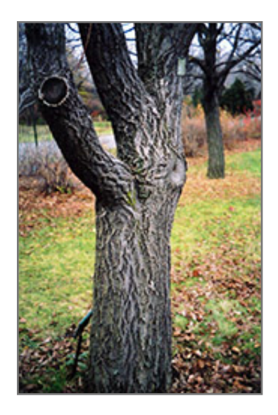
Amur Cork Tree bark