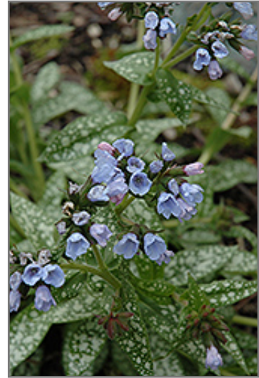
Roy Davidson Lungwort flowers