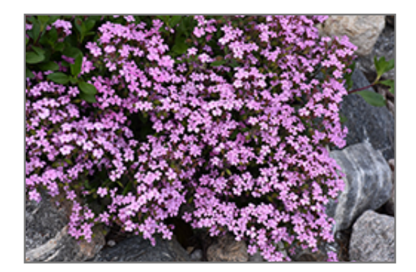
Rock Soapwort in bloom