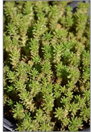
Six Row Stonecrop foliage

* This is a 'special order' plant - contact store for details