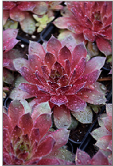
More Honey Hens And Chicks