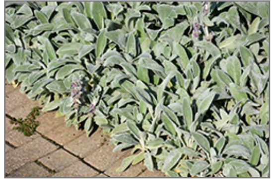
Lamb's Ears

Lamb's Ears will grow to be about 12 inches tall at maturity extending to 24 inches tall with the flowers, with a spread of 18 inches. When grown in masses or used as a bedding plant, individual plants should be spaced approximately 15 inches apart. Its foliage tends to remain dense right to the ground, not requiring facer plants in front. It grows at a fast rate, and under ideal conditions can be expected to live for approximately 10 years. As an herbaceous perennial, this plant will usually die back to the crown each winter, and will regrow from the base each spring. Be careful not to disturb the crown in late winter when it may not be readily seen!