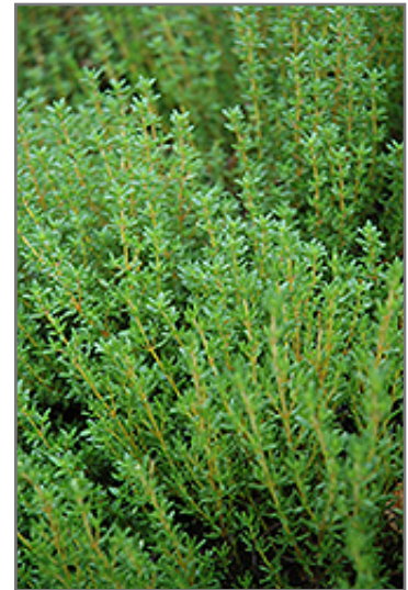
Common Thyme foliage