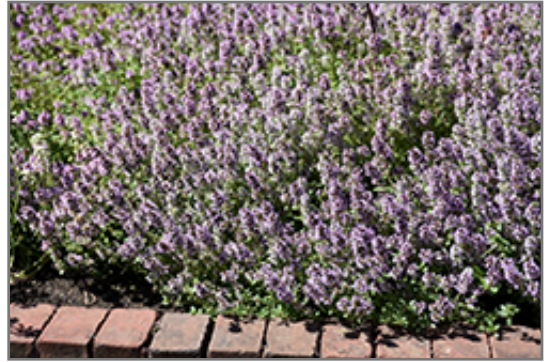
Common Thyme in bloom

Common Thyme is smothered in stunning clusters of pink flowers at the ends of the stems from early to mid summer. Its attractive tiny fragrant round leaves remain grayish green in color throughout the year.