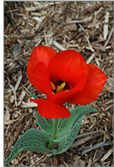
Casa Grande Tulip flowers