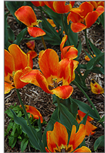
Flair Tulip flowers