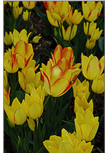
Georgette Tulip flowers