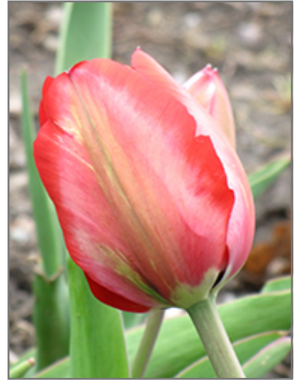
Menton Tulip flowers