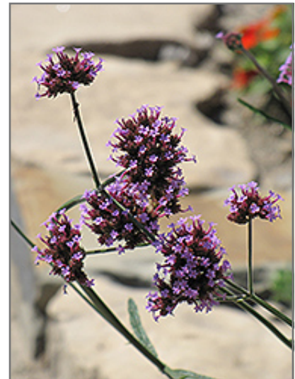
Tall Verbena flowers