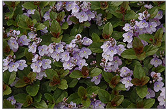
Waterperry Blue Speedwell flowers