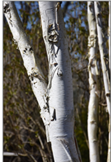
Filigree Lace European Birch bark