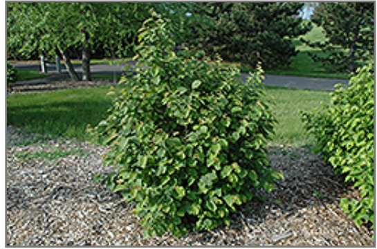
Beaked Hazelnut

Beaked Hazelnut will grow to be about 8 feet tall at maturity, with a spread of 7 feet. It tends to be a little leggy, with a typical clearance of 2 feet from the ground, and is suitable for planting under power lines. It grows at a medium rate, and under ideal conditions can be expected to live for approximately 30 years. While it is considered to be somewhat self-pollinating, it tends to set heavier quantities of fruit with a different variety of the same species growing nearby.