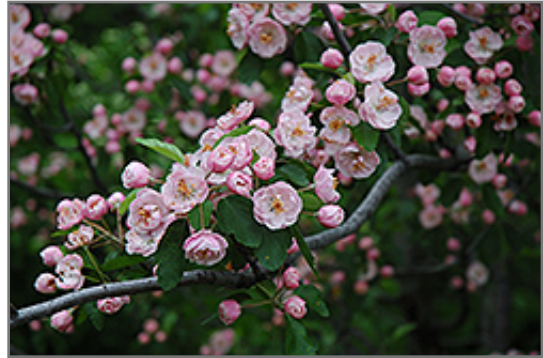
Bechtel's Flowering Crab flowers