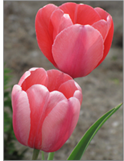
Pink Impression Tulip flowers