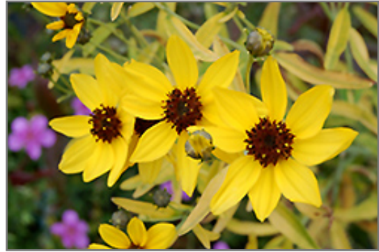
Lightning Flash Tickseed flowers

Lightning Flash Tickseed is recommended for the following landscape applications;