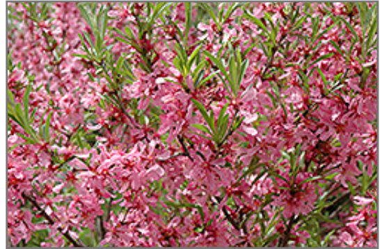
Russian Almond flowers