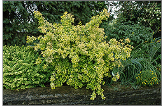
Gold Leaf Forsythia

Gold Leaf Forsythia is recommended for the following landscape applications;