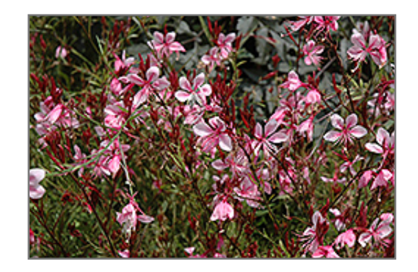
Butterfly Gaura flowers