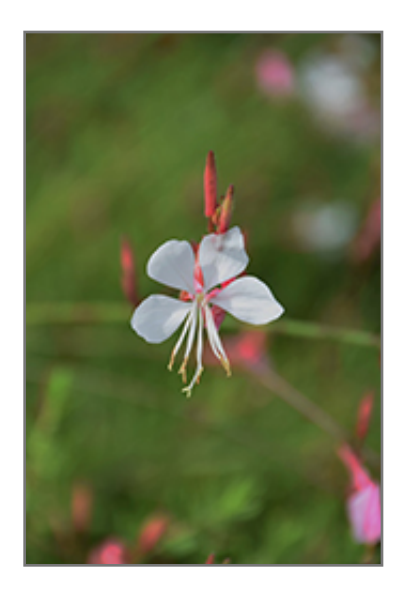
Butterfly Gaura flowers

361 N. Hunter Highway Drums, PA 18222 (570) 788-4181 www.beechwood-gardens.com