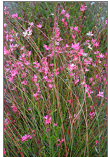
Ballerina Rose Gaura in bloom