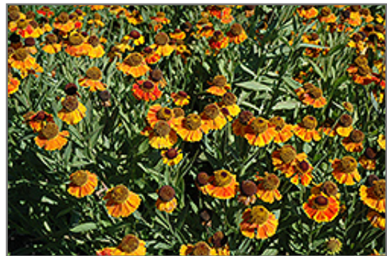
Sahin's Early Flowerer Sneezeweed flowers