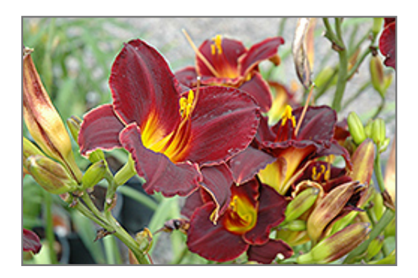
Siloam Showgirl Daylily flowers

361 N. Hunter Highway Drums, PA 18222 (570) 788-4181 www.beechwood-gardens.com