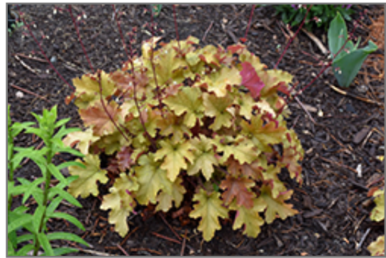
Marmalade Coral Bells