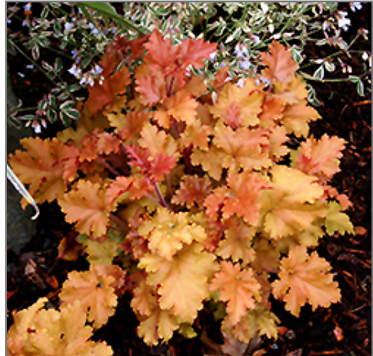
Marmalade Coral Bells foliage

Marmalade Coral Bells will grow to be about 8 inches tall at maturity extending to 18 inches tall with the flowers, with a spread of 16 inches. When grown in masses or used as a bedding plant, individual plants should be spaced approximately 14 inches apart. Its foliage tends to remain low and dense right to the ground. It grows at a medium rate, and under ideal conditions can be expected to live for approximately 10 years. As an evergreen perennial, this plant will typically keep its form and foliage year-round.