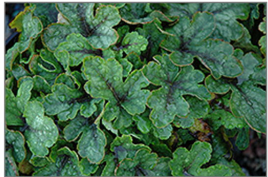
Dayglow Pink Foamy Bells foliage