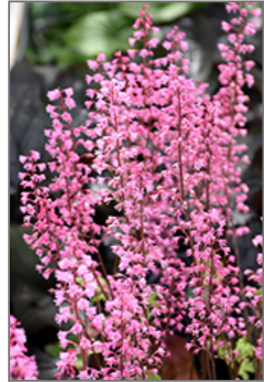
Dayglow Pink Foamy Bells flowers

* This is a 'special order' plant - contact store for details