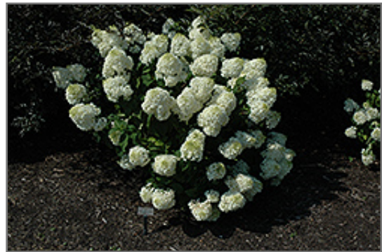
Silver Dollar Hydrangea in bloom