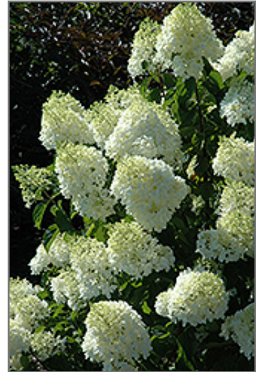
Silver Dollar Hydrangea flowers

* This is a 'special order' plant - contact store for details