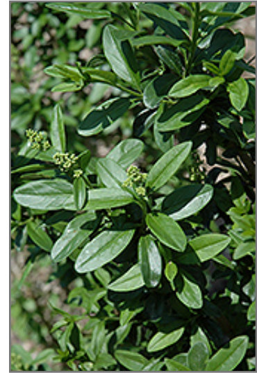
California Privet foliage