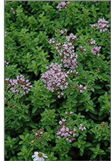
Dwarf Oregano flowers

Aside from its primary use as an edible, Dwarf Oregano is suitable for the following landscape applications;