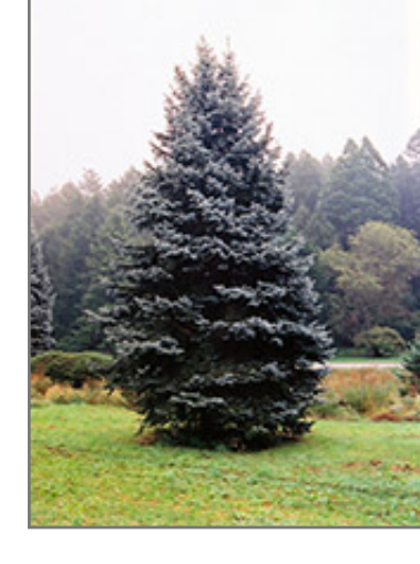
Royal Blue Spruce

361 N. Hunter Highway Drums, PA 18222 (570) 788-4181 www.beechwood-gardens.com