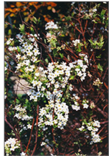
Mount Fuji Spirea flowers