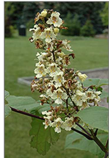
Chinese Catalpa flowers