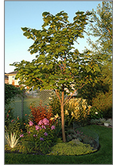
Chinese Catalpa