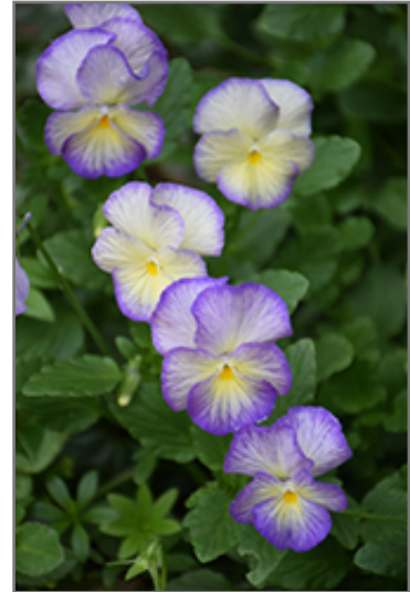
Etain Pansy flowers