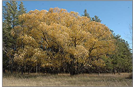
White Willow in fall